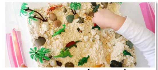
preschool DINOSAUR SENSORY BIN