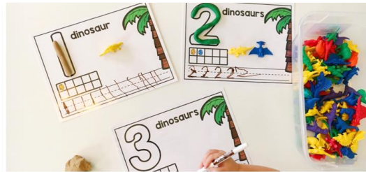
preschool DINO NUMBER SENSE MATS