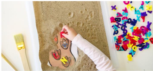
preschool digging FOR FOSSIL SOUNDS

Want to see more photos of each of this week's activities in action? Click here for large detailed photos of our preschool adventures! Preschool: Dinosaurs