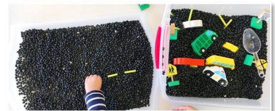
preschool ROAD THEME SENSORY BIN