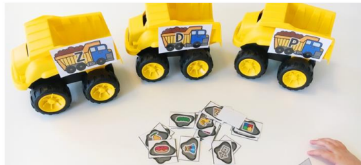
preschool DUMP TRUCK SOUND SORT

Want to see more photos of each of this week's activities in action? Click here for large detailed photos of our preschool adventures! Preschool: Transportation