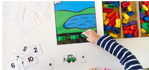
preschool TRANSPORTATION STORY MATS