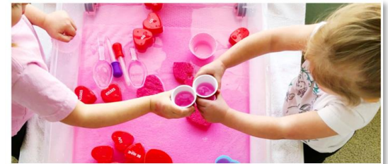
preschool VALENTINES WATER PLAY