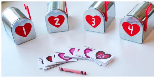
preschool VALENTINE SYLLABLE SORT

Want to see more photos of each of this week's activities in action? Click here for large detailed photos of our preschool adventures! Preschool: Valentines