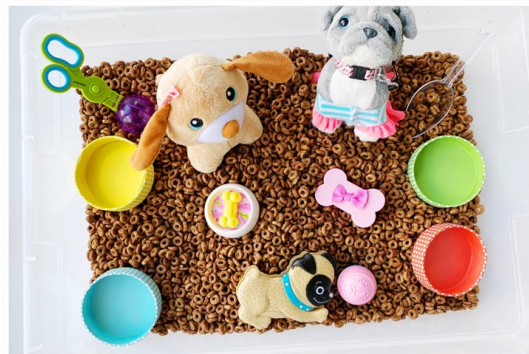
preschool FEED THE PUPPIES BIN