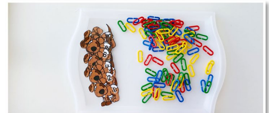
preschool LINK A LEASH