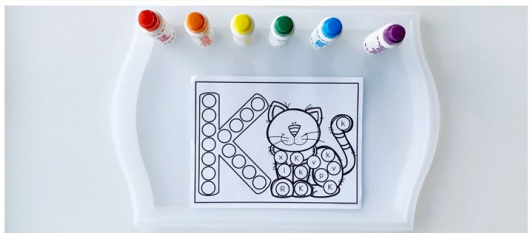
preschool KITTEN SOUND STAMPING

Want to see more photos of each of this week's activities in action? Click here for large detailed photos of our preschool adventures! Preschool: Pets