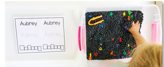
Tot School BUILD MY NAME SENSORY BIN