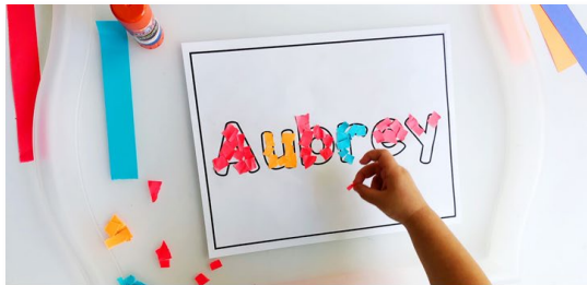
Tot School TEAR AND STICK NAMES

Want to see more photos of each of this week's activities in action? Click here for large detailed photos of our tot school adventures! Tot School: About Me