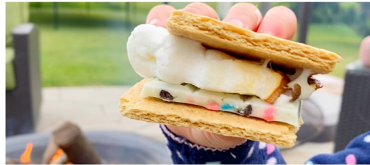
Tot School PATRIOTIC SNACK IDEAS