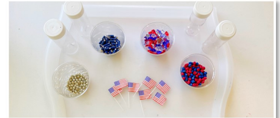
Tot School PATRIOTIC SHAKERS