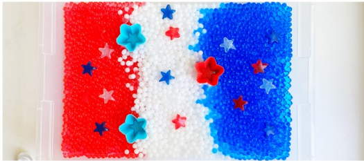
Tot School PATRIOTIC WATER BEAD BIN

Want to see more photos of each of this week's activities in action? Click here for large detailed photos of our tot school adventures! Tot School: Patriotic