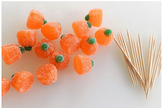
Tot School PUMPKIN BUILDING

Want to see more photos of each of this week's activities in action? Click here for large detailed photos of our tot school adventures! Tot School: Halloween