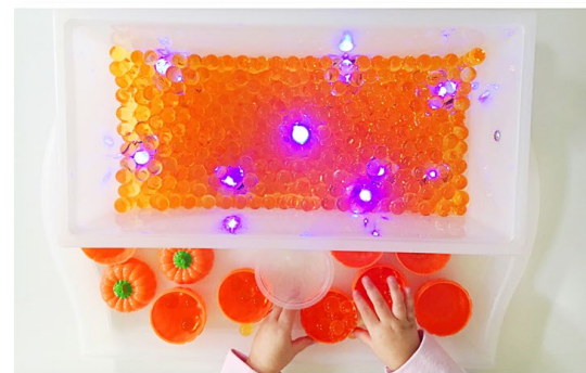
Tot School GLOWING PUMPKINS