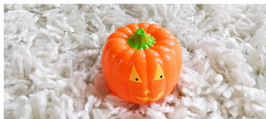
Tot School PUMPKIN PATCH PICK UP